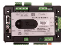
ComAp IntelliGen BaseBox