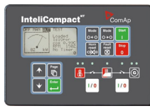
ComAp IntelliCompact NT SPTM